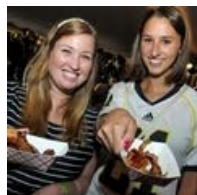
Bacon Bash 2014