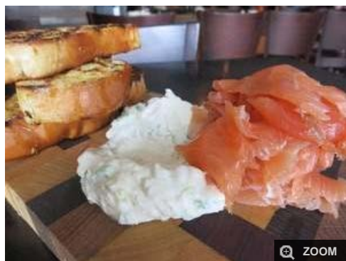
House-cured salmon lox with scallion-laced Lily cream cheese and grilled garlic bread at the Root.